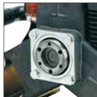
REAR SIDE SPLINE SHAFT