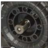
● POST - REAR - 3A