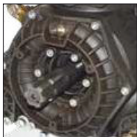
● ANT. - FRONT