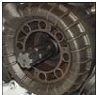
● POST - REAR - 3A