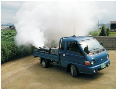
MACHINE ON VAN